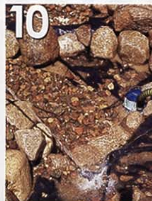
10 Wash stones