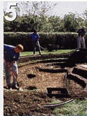
5 Excavate pond