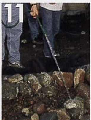
11 Fill pond. LUNCH TIME!