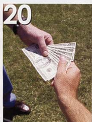
20 Get paid!