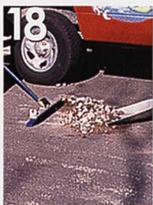
18 Clean up