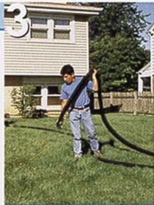
3 Lay plumbing