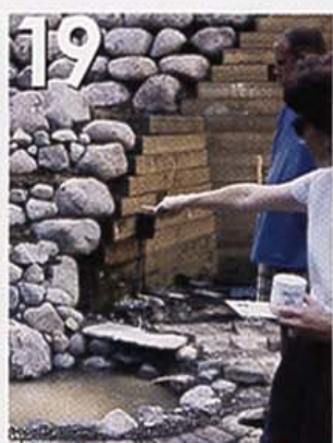
19 Give homeowner bacteria & owners manual