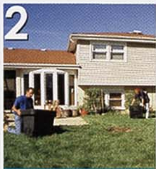
2 Place Skimmer and BIOFALLS® Filter