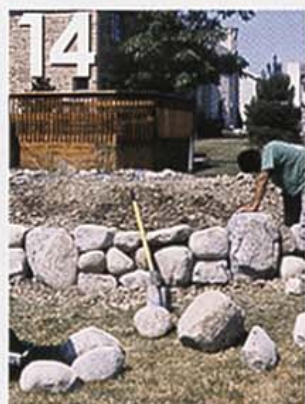
14 Build retaining wall