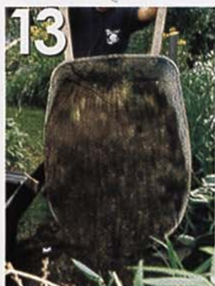
13 Bring in top soil