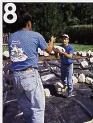
8 Rock in pond