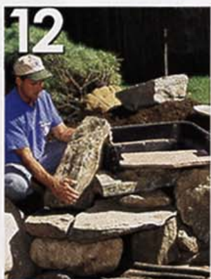
12 Build waterfall & stream