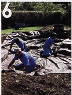
6 Install liner and underlayment