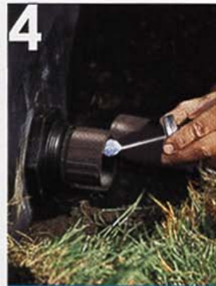
4 Hook up BIOFALLS® Filter