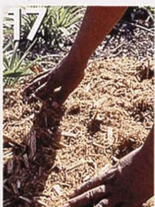
17 Mulch berm