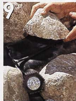
9 Position underwater lights