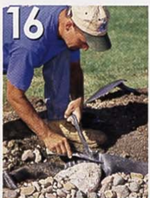
16 Trim liner