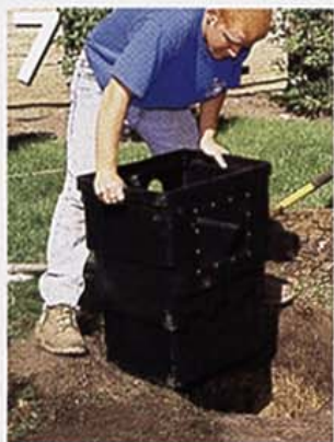
7 Hook-up skimmer