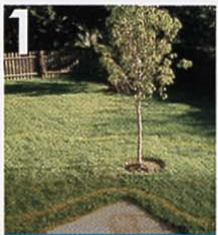
1 Mark pond area